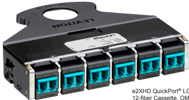
e2XHD QuickPort® LC 12-fiber Cassette, OM3