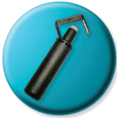
Duct Stripping Tool 19.0mm - 40.00mm