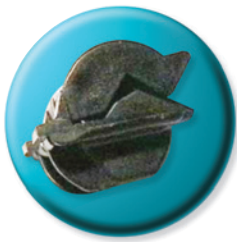
Radial Tube Cutter