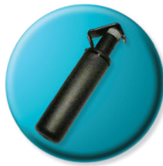
Duct Stripping Tool 4.5mm - 29.00mm